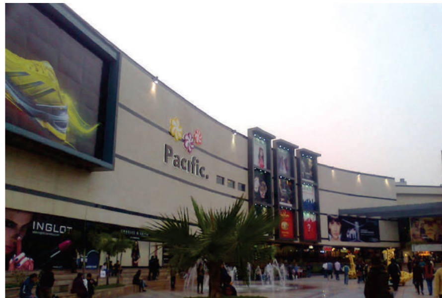
Pacific Mall, New Delhi, India