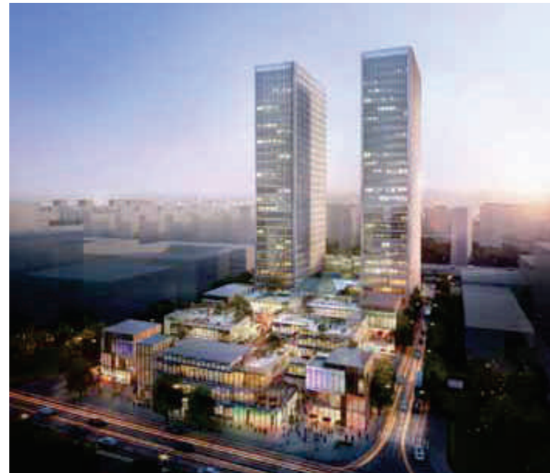
Qian Tan Office Park, Shanghai, China