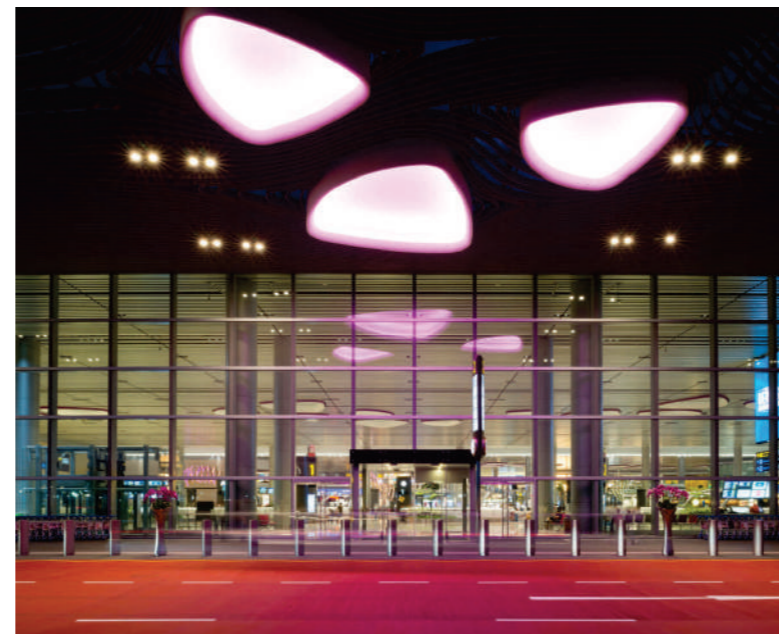
Changi Airport, Singapore