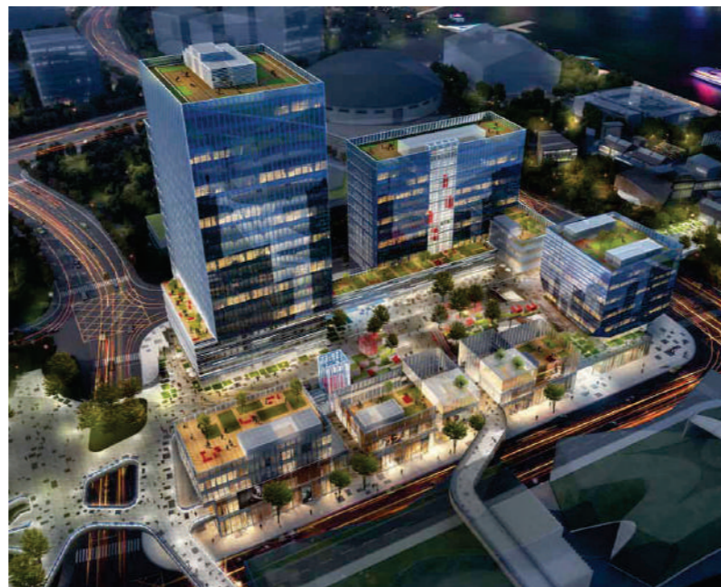
Mango West Bund Plaza, China

Creating sustainable and healthy workplaces is at the forefront of Benoy's thinking. The Team investigates not only the performance of the development but also the well-being of the end user.