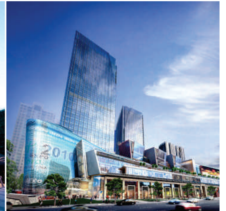
Shanghai ICC, Shanghai, China