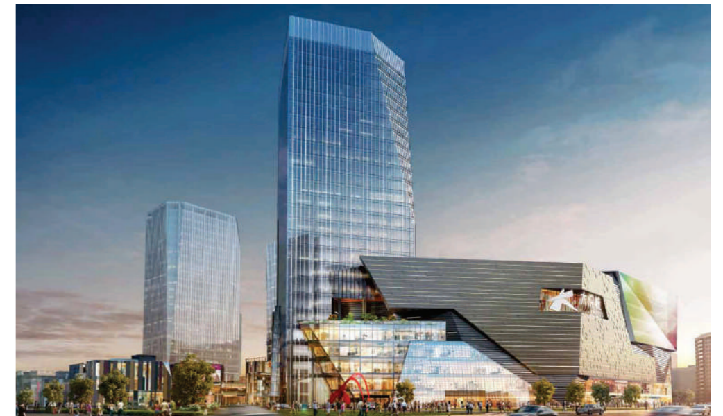
Joy City, Hangzhou, China