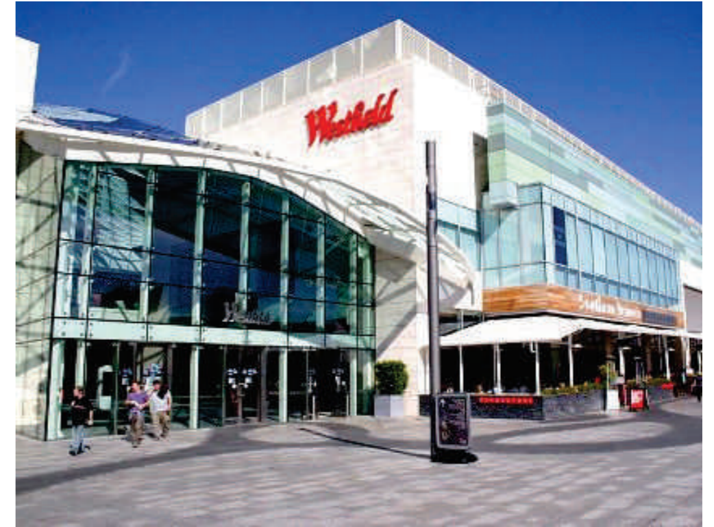
Westfield Mall, London