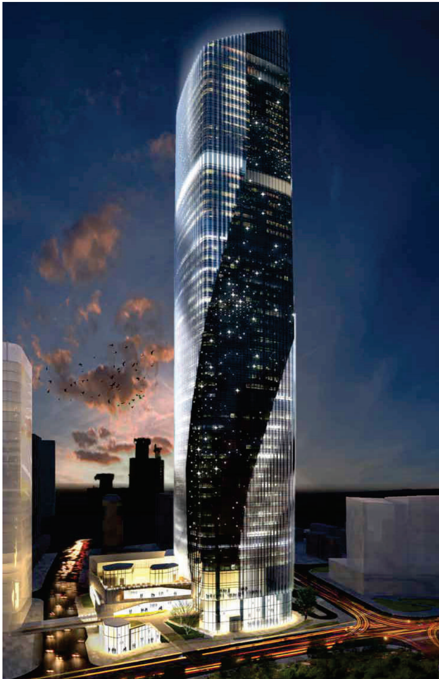
Ningbo New World, Ningbo, China