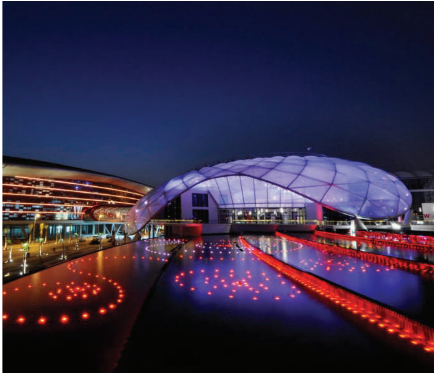
Ferrari World, Abu Dhabi, UAE