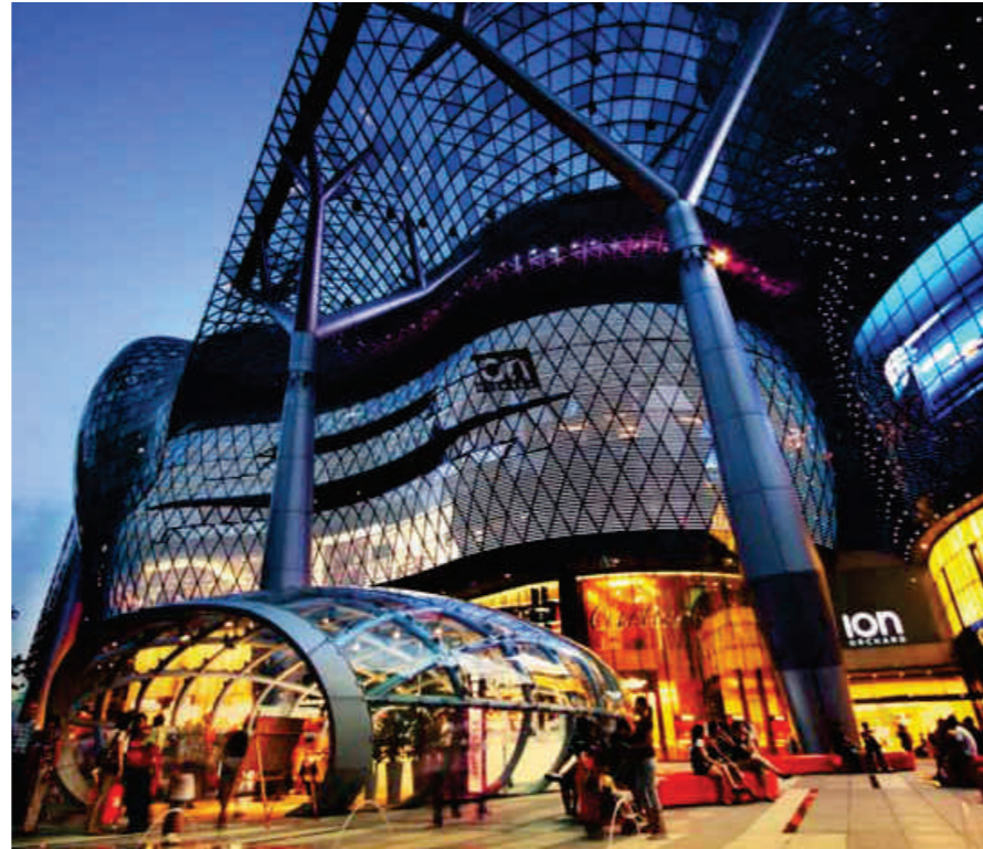
Ion Orchard, Singapore