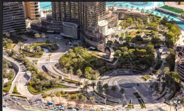
Iconic Burj Khalifa