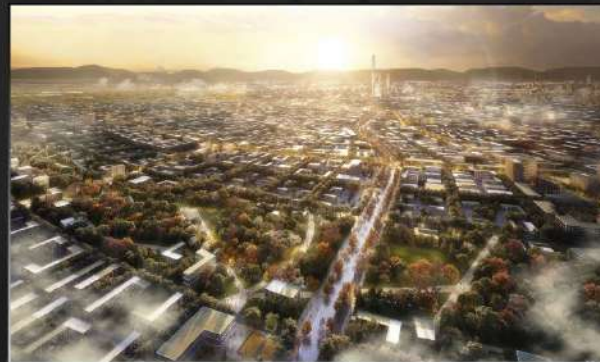
Premium Residential Tashkent