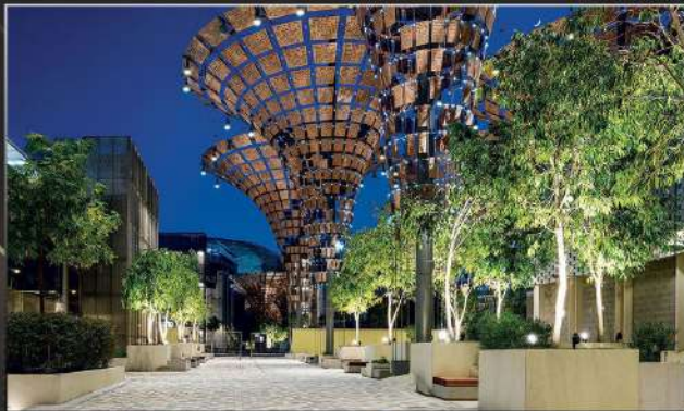
Dubai Expo 2020