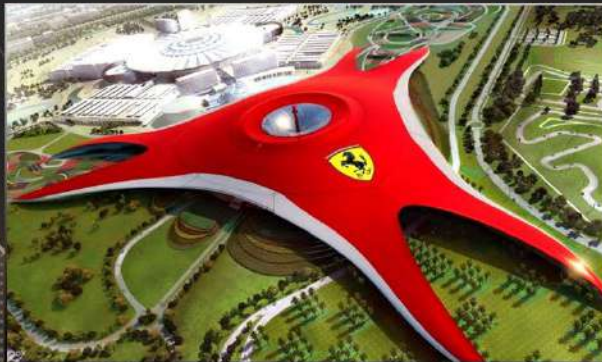
Ferrari World Abu Dhabi