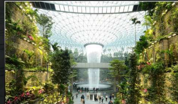
Changi Airport Singapore