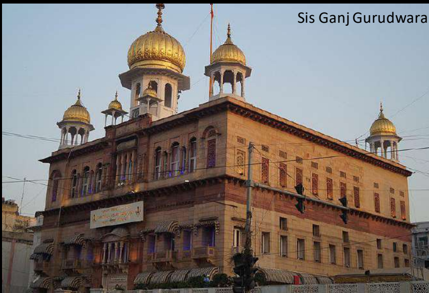
Sis Ganj Gurudwara