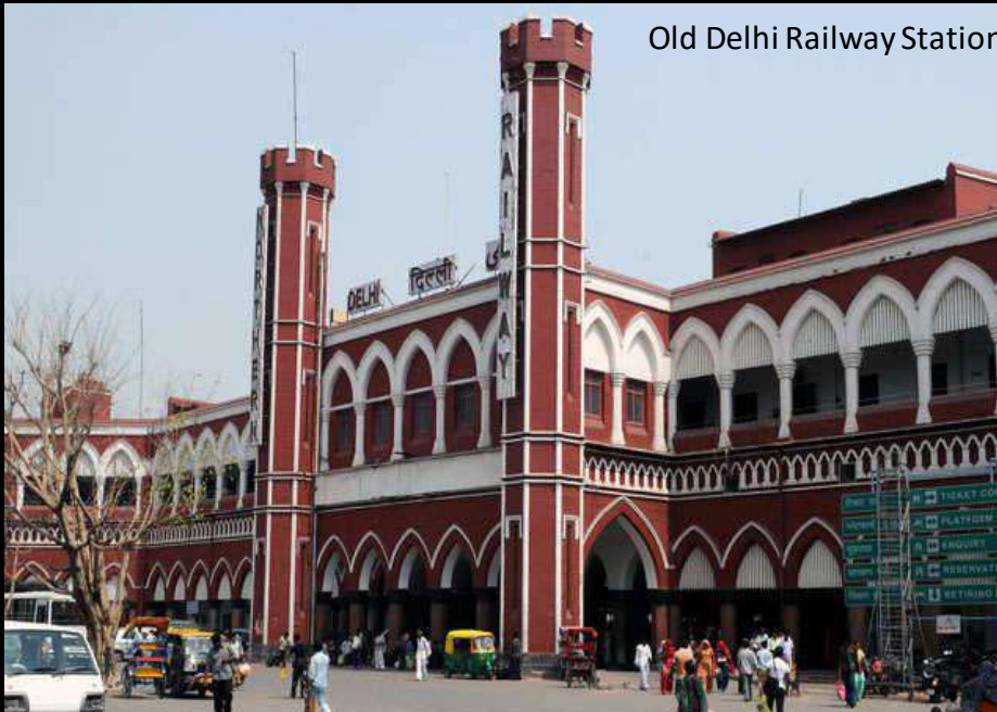
Old Delhi Railway Station