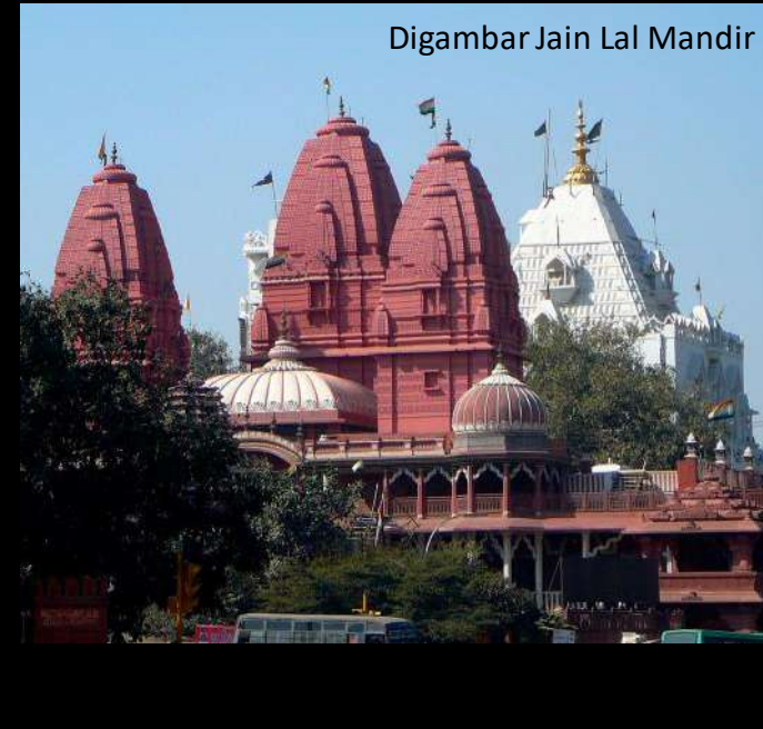
Digambar Jain Lal Mandir